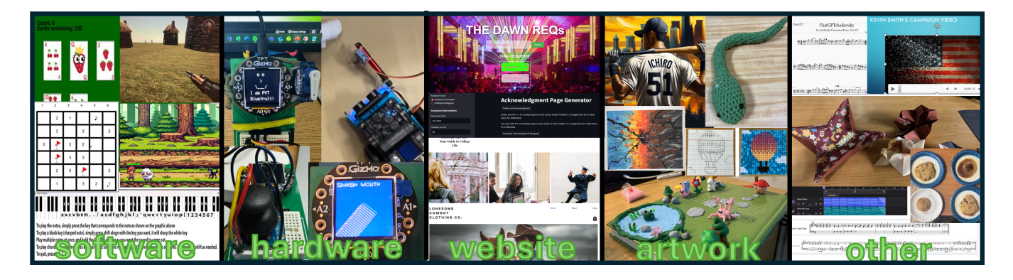
Figure 2: Projects students created by teaming with AI

Fostering Creativity: Student-Generative AI Teaming in an Open-Ended CS0 Assignment